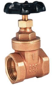
Pictured Model T-400/S-400